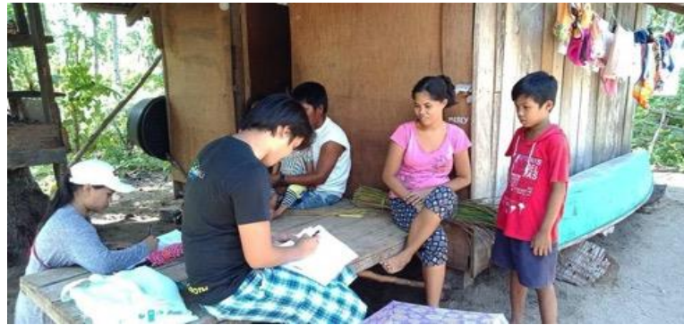
Community profiling and socio-economic surveying