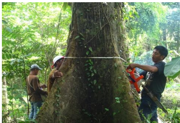
Forest Resource Inventory