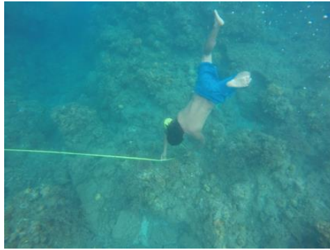
Participatory Coastal Resource Assessment