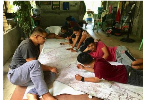
Three Dimensional Mapping